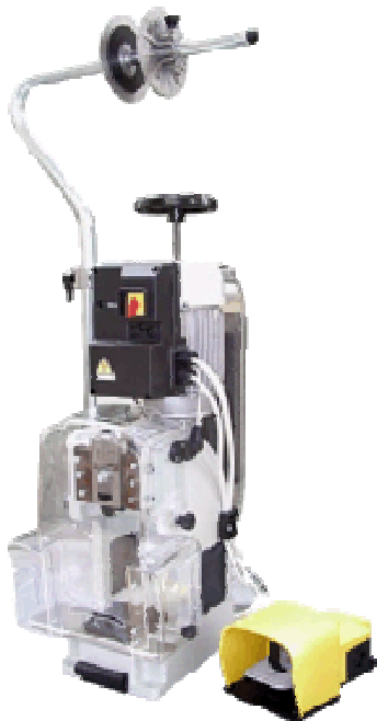
INO CPM - TT